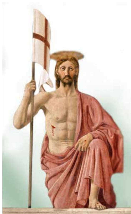
Resurrection - Piero della Francesca

On the evening of that "first day," Jesus enters the house in which his disciples had barricaded themselves, filled with fear and anguish, and he says to them: "Peace be with you!" (Jn. 20:19) He shows them the signs of his crucifixion and then fills them with the breath of his Spirit. His breath rekindles life in his disciples, who had lost all hope. It calms their inner turmoil and fills them with the dream of a different, renewed, united humanity. From that moment on, the real proof of the Lord's resurrection is this small community that succeeds in overcoming its fears, experiences forgiveness and is prompt to forgive, courageously throwing open its closed doors so as to proclaim the power of the resurrection, which is a sign of the presence of the Risen Christ reflected in